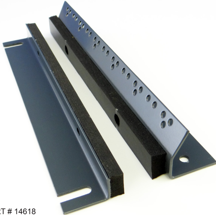
PART # 14618

Save time and eliminate expensive fussy cable bulk head connectors with this Centroid Electrical cabinet cable entry management system. This invention allows all the CNC cabinet cables to enter the cabinet thru one rectangular hole in the bottom of the cabinet. The system both strain relieves, supports and organizes the cables coming into the electrical cabinet. This system eliminates having to drill many holes in the cabinet significantly reducing cable installation labor and connector costs. Also this system make for a more reliable electrical cabinet with less holes in the electrical cabinet that means less chances for dust, chips, dirt , fluids to enter the cabinet and potentially damage the CNC electronics. With this system it is easy to add or remove a cable with no holes to drill or cover up after a cable addition or subtraction. Reusable and resealable any number of times. Installation is easy simply cut one rectangular hole in the bottom on the cabinet and 4 mounting holes and all necessary CNC cables can be installed using this one entry point. Made in USA, Steel construction with Poron sandwich. 10.5" long.